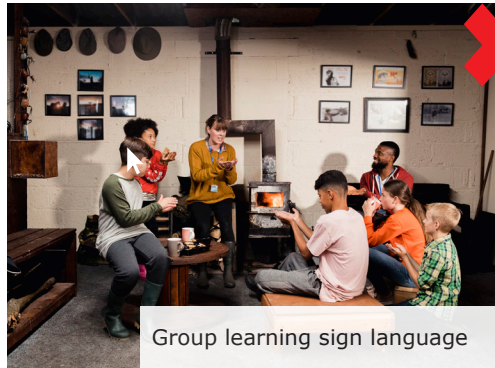
Group learning sign language