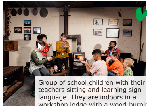
Group of school children with their teachers sitting and learning sign language. They are indoors in a workshop lodge with a wood-burning stove lit in the background.

Alternative text (alt text) and visual descriptions are text-based descriptions of visual content. 8 These benefit blind, deafblind, and low-vision students. Alt text is typically hidden by internet browsers but can be read by screen readers. Visual descriptions go into more detail and can be used in image captions, embedded in the body of the text, or uploaded as attachments. There are many different strategies for adding alt text or visual descriptions, depending on the platform. Some platforms add automatic alt text—but check for accuracy!